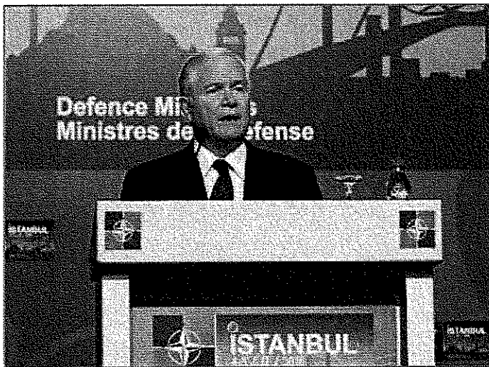
Defense Secretary Robert M. Gates conducts a press conference following the NATO Defense Ministerial in Istanbul, Turkey, Feb. 5, 2010.

U.S. nuclear weapons have played an essential role in extending deterrence to U.S. allies and partners against nuclear attacks or nuclear-backed coercion by states in their region that possess or are seeking nuclear weapons. A credible U.S. “nuclear umbrella” has been provided by a