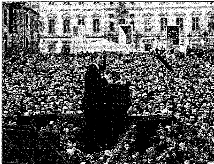
President Barack Obama unveils his vision for reducing nuclear dangers and pursuing the long-term goal of a world without nuclear weapons in Prague’s Hradcany Square on Apr. 5, 2009.

In his April 2009 speech in Prague, President Obama highlighted 21 st century nuclear dangers, declaring that to overcome these grave and growing threats, the United States will “seek the peace and security of a world without nuclear weapons.” He recognized that such an ambitious goal could not be reached quickly – perhaps, he said, not in his lifetime. But the President expressed his determination to take concrete steps toward that goal, including by reducing the number of nuclear weapons and their role in U.S. national security strategy. At the same time, he pledged that as long as nuclear weapons exist, the United States will maintain a safe, secure, and effective arsenal, both to deter potential adversaries and to assure U.S. allies and other security partners that they can count on America’s security commitments.