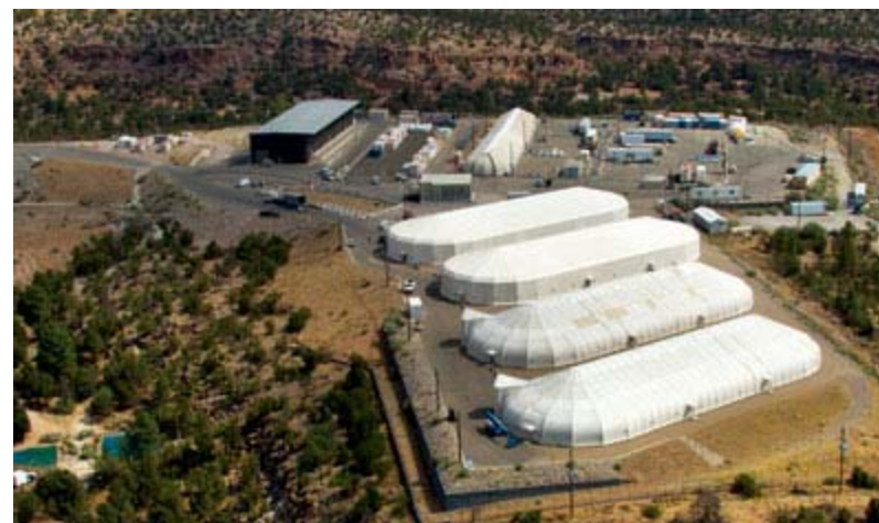
Transuranic Waste Storage at LANL Area G