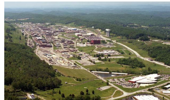
Y-12 National Security Complex

Resident Inspectors perform near-continuous oversight at Hanford, Los Alamos, Pantex, Savannah River Site, and Y-12