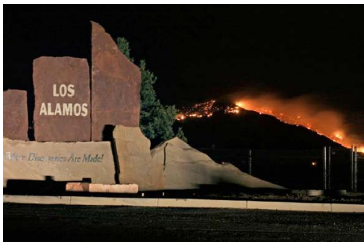
2000 Cerro Grande Wildland Fire