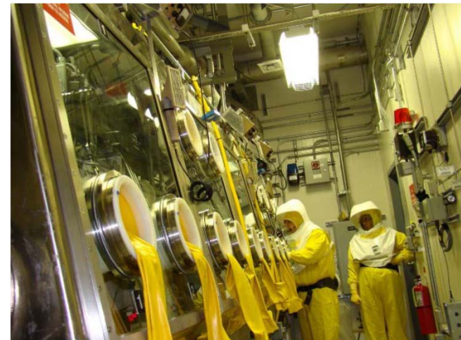
Glovebox Operations at Savannah River Site

DOE is required by law to grant the Board “ready access to such facilities, personnel, and information as the Board considers necessary to carry out its responsibilities.”