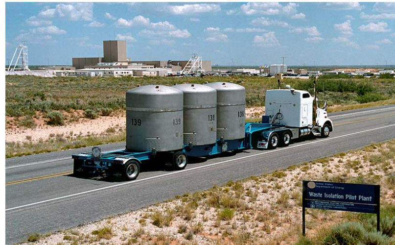
Waste Isolation Pilot Plant