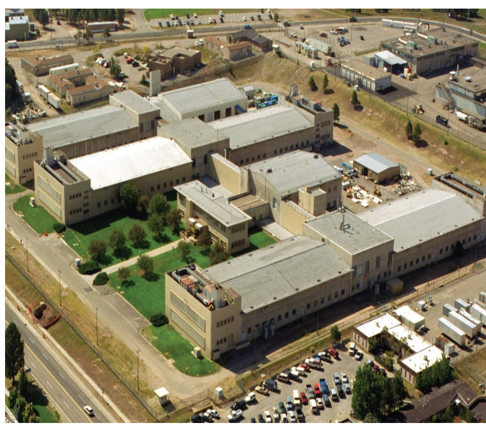
Chemistry and Metallurgy Research facility