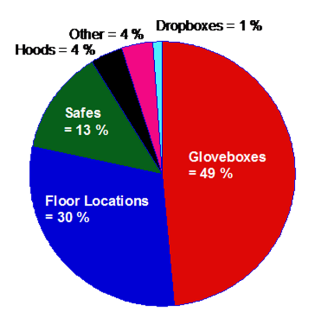
Figure 3: Distribution of MAR by location type on the first floor of PF-4.

Gloveboxes and floor locations are the most vulnerable to impacts from seismic events and fires, yet these locations hold nearly 80 percent of the MAR (Figure 3). For example, floor