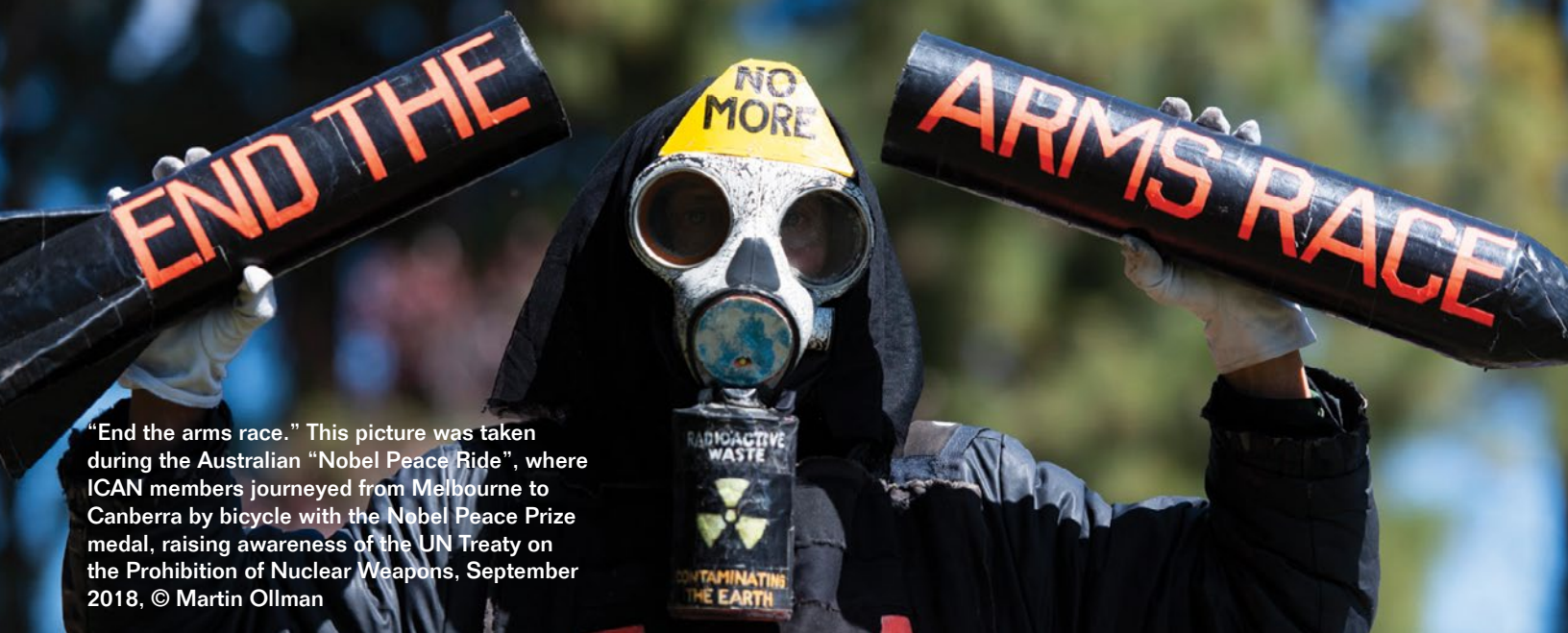
“End the arms race.” This picture was taken during the Australian “Nobel Peace Ride”, where ICAN members journeyed from Melbourne to Canberra by bicycle with the Nobel Peace Prize medal, raising awareness of the UN Treaty on the Prohibition of Nuclear Weapons, September 2018