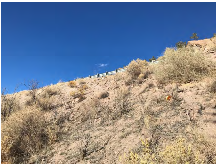
Example of a drop off along the Pajarito corridor

LANL TSD. The LANL TSD briefly describes credible accident scenarios with a list of safety controls for each event; however, it does not contain a safety analysis of the effectiveness of the control set for each specific accident scenario. Instead, the TSD provides generic safety functions for each safety control and a high-level qualitative evaluation of the effectiveness of the entire suite of safety controls, which the TSD refers to as a barrier analysis. As an example, the tie-down system is credited as a preventive safety control in the event of a fire following a leak or spill of vehicle fuel due to operator error. However, its generic safety function is to reduce the likelihood of a release by restricting the movement of packages, and thus is not effective at preventing the fire scenario for which it is credited. Additionally, the TSD does not contain any quantitative safety analysis of credible accident scenarios, nor does it analyze all transportation-related hazards. For example, most onsite transfers at LANL occur along the Pajarito corridor, and the cliffs along this route are not mentioned or analyzed in the TSD.