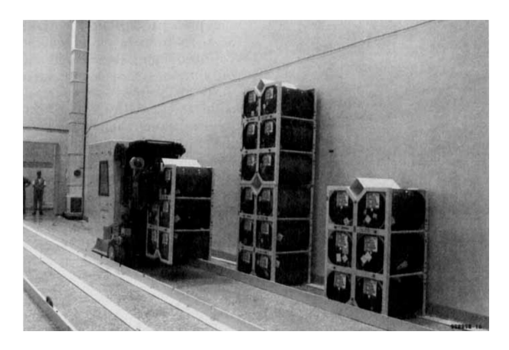
Figure 1. Initial loading of a room at Building 12-116 (late 1990s) with AL-R8 containers without sealed inserts in a "stage-right" configuration.

Pit Containers—The following containers are currently in use for pit staging at Pantex: the AL-R8 without sealed insert, AL-R8 Sealed Insert, and FL containers. Other approved pit containers, as described in Table 2.7.8-1, Nuclear Materials Container Summary , of the Sitewide SAR [9] and on the approved containers list of Section 5.7.9.1 of the TSRs [5], are not currently in use.<sup>2</sup> A brief description of pit containers currently in use at Pantex follows: