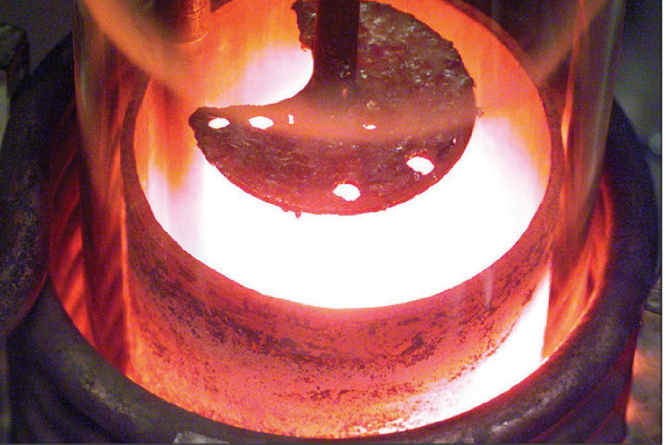
Forging of Molten Plutonium at Los Alamos National Laboratory (LANL)

NNSA has realized approximately $35.1 million in anticipated cost savings during the first 3 years of the contract—specifically, lower overall contractor fees paid to Triad versus fees it would have paid the previous LANL contractor. However, in January 2020, GAO found that NNSA did not provide details on the limitations and uncertainties that could affect its cost savings estimate. Such limitations make it difficult to assess how much NNSA can expect to save going forward. For example, NNSA would not realize the total $76.1 million it anticipated saving if it does not award Triad option years—the last 5 years of the 10 possible years of the contract—which NNSA may award based on contractor performance. NNSA officials stated that Triad has made progress in stabilizing LANL's workforce and has consistently met its annual goal for small business participation. However, Triad is facing challenges attracting new staff and small businesses due to LANL's remote location and the unique nature of LANL's work. NNSA officials said it is too early in the contract's period of performance to determine Triad's overall success in these areas.