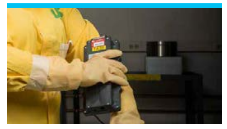
Pit Quality Acceptance