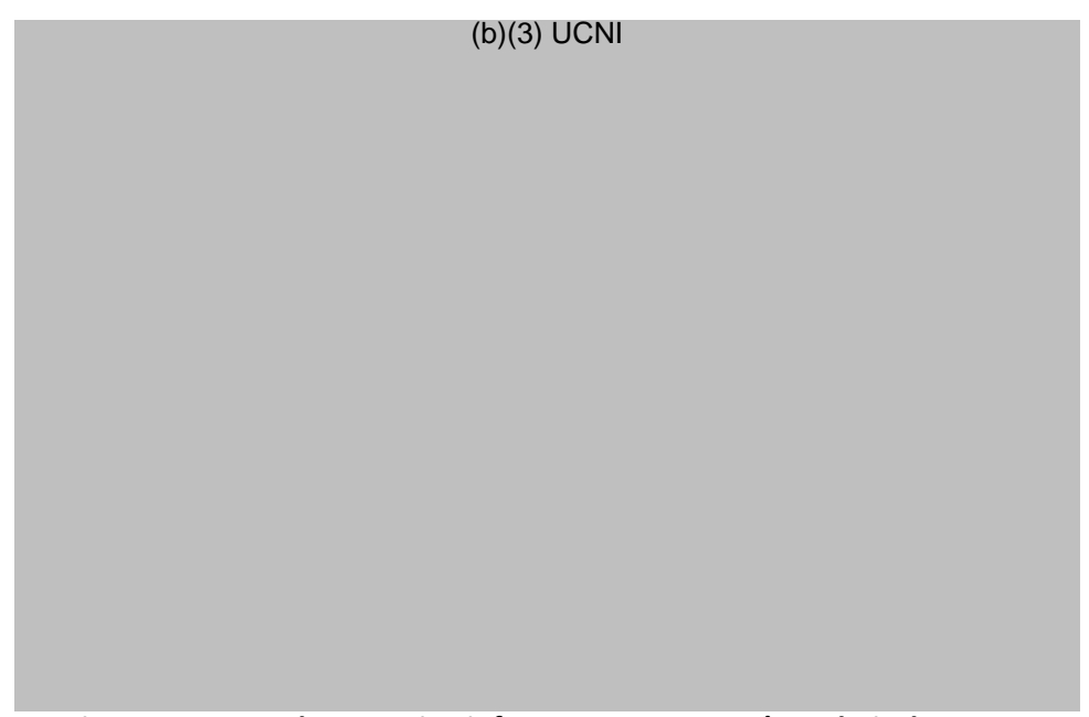
Figure 1: PF-4 and supporting infrastructure at LANL's Technical Area 55

PF-4 is the only operational facility in the Nation with the full suite of capabilities necessary to execute plutonium missions essential to national security, materials disposition, and nuclear energy. Key manufacturing and science capabilities located in PF-4 include metal purification, casting, machining and component fabrication; nuclear materials separation, processing, and recovery; surplus plutonium pit disassembly and oxide production; and actinide chemistry and metallurgy.