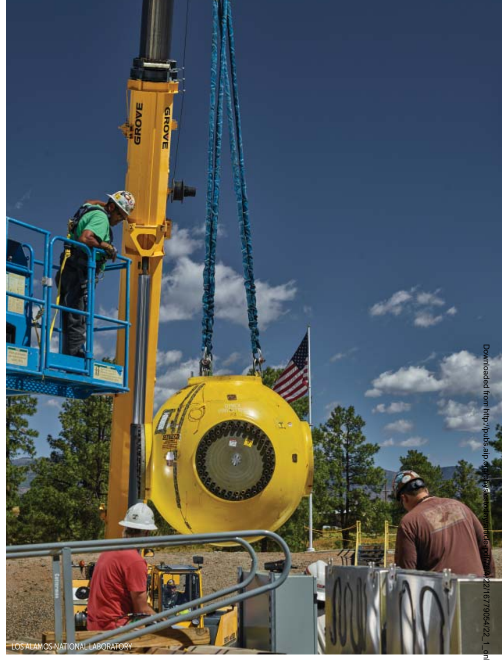
A BLAST CONTAINMENT chamber is lowered into place at the Dual-Axis Radiographic Hydrodynamic Test facility at Los Alamos National Laboratory. Explosive tests on mock pits made from surrogate metals are used to help determine how plutonium will compress as the pit of a nuclear weapon implodes.

To address the lack of physical space at LANL, the NNSA in 2018 devised a two-site strategy: The sprawling Savannah River Site (SRS) in South Carolina was designated to fabricate 50 pits out of the 80-pit requirement per year. That plan requires repurposing a partially completed 46 000 m<sup>2</sup> facility that was intended to turn surplus weapons plutonium into mixed oxide (MOX) fuel for commercial reactors. (See "Los Alamos to share plutonium pit production with