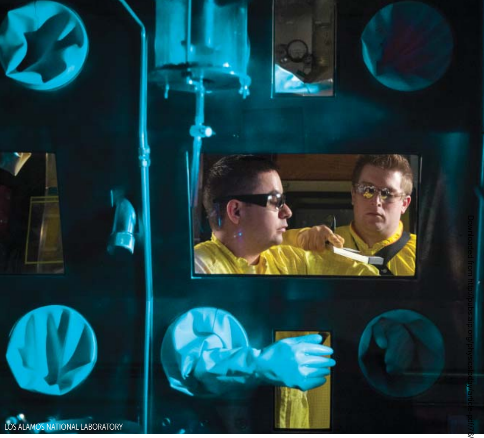
TECHNICIANS PERFORM radiological control assessments after working with plutonium in a glove box at Los Alamos National Laboratory. The availability of new glove boxes is a key constraint on when the NNSA will be able to achieve its goal to produce 80 pits per year.

In the January report, the GAO said that the NNSA lacks a comprehensive schedule and an overall cost estimate for the 80-pit-per-year capability that meet GAO standards. On the basis of the NNSA's fiscal year 2023 budget documents, though, the GAO estimates the total price tag to reestablish pit production at the required rate will be at least