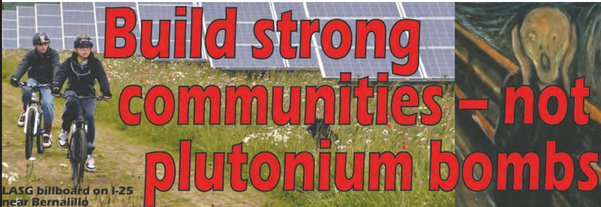
LASG billboard on I-25 near Bernalillo

Until then, at least 15-25 years from now (or even longer if the U.S. stockpile shrinks), no new pits are needed. Right now, the U.S. has a gigantic arsenal of 2,000 deployed warheads with 1,800 in reserve and 1,750 retired warheads, plus about 5,600 aging but useable spare pits, depending on type.