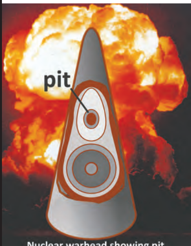
Nuclear warhead showing pit

Twenty-two miles from the Santa Fe Plaza, the National Nuclear Security Administration (NNSA) has a crash program to build a plutonium processing center and nuclear weapons factory at Los Alamos National Laboratory (LANL). Its purpose is to make plutonium warhead cores ("pits") for a new kind of warhead for a new $100 billion intercontinental ballistic missile (ICBM). To create the new factory LANL is remodeling its 1970s vintage plutonium facility while also constructing new infrastructure on a large scale.