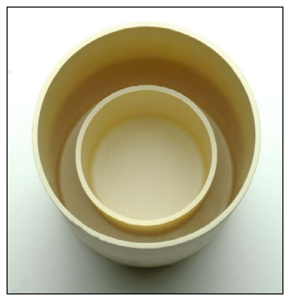
Figure 3.A Crucible for Electrorefining Plutonium