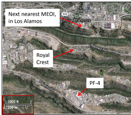
Figure I. Royal Crest, PF-4, Los Alamos