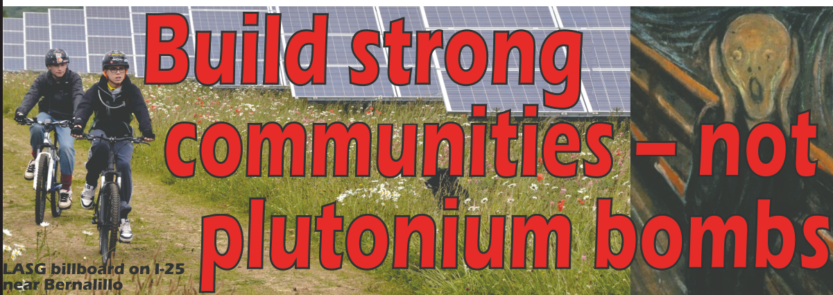
LASG billboard on I-25 near Bernalillo

Until then, at least 15-25 years from now (or even longer if the U.S. stockpile shrinks), no new pits are needed. Right now, the U.S. has a gigantic arsenal of 2,000 deployed warheads with 1,800 in reserve and 1,750 retired warheads, plus about 5,600 aging but useable spare pits, depending on type.