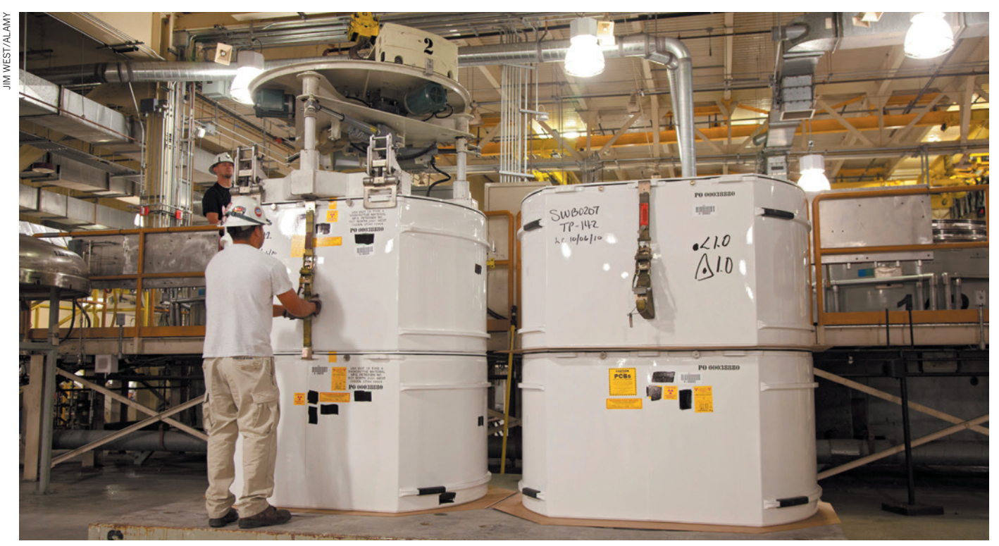
Drums containing contaminated materials from the US nuclear-defence programme are stored at the Waste Isolation Pilot Plant in New Mexico.

CONSERVATION Europe's refugee fences will isolate and entangle wildlife p.156