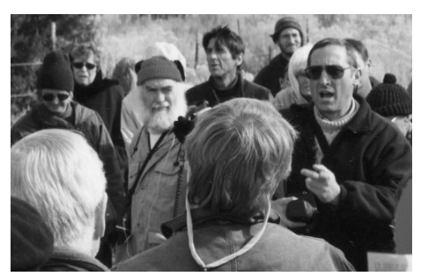
More than 80 people attended a January 2002 teach-in at Los Alamos. Here we are gathered near the Area G nuclear waste disposal site.